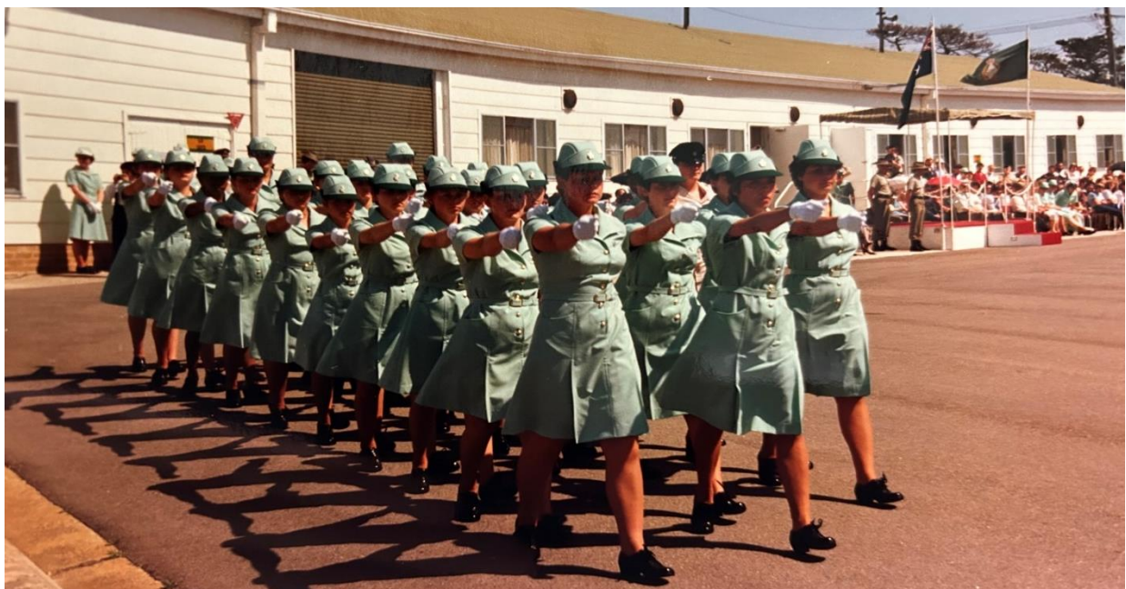
March out Parade WRAAC School 1982