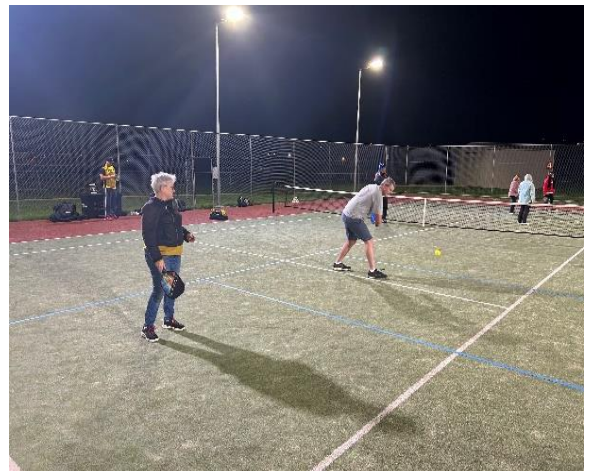
Steffi Graf and Andre Agassi