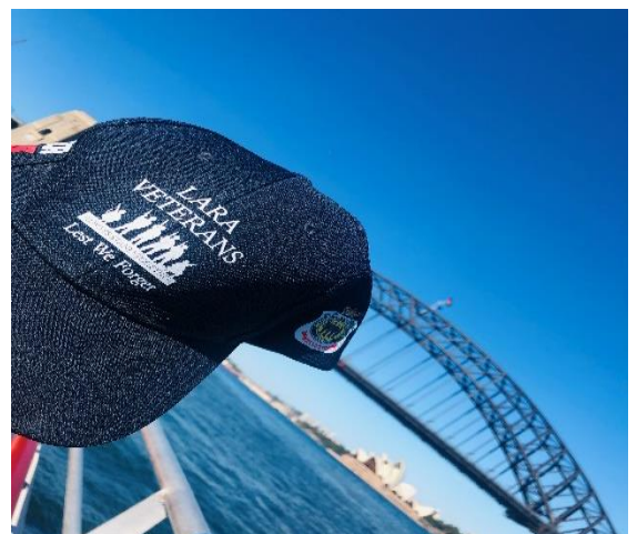
A coat hanger for the hat?