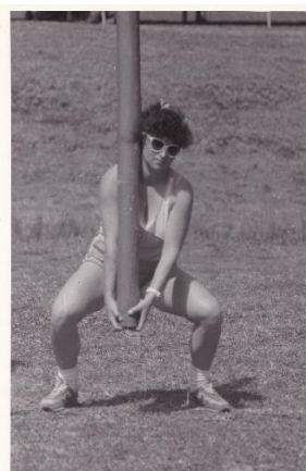
Athletic Carnival 1987