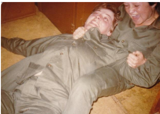
Let's get to know each other

In 1985 female soldiers begun training alongside male recruits at 1 Recruit Training Battalion (1 RTB) at Kapooka. This ended the establishment of the WRAAC School and the beginning of male/female training at Wagga Wagga.