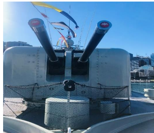
Fore Deck guns and hat in Darling Harbour.