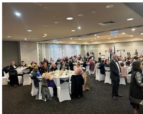
Early in the evening