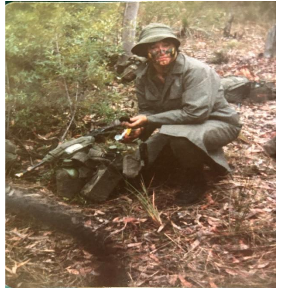
"Not my preferred make up"