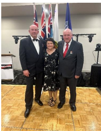
Lara RSL Contingent