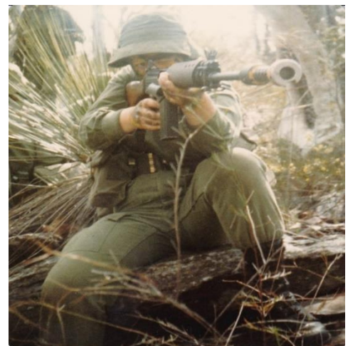
So.....you feelin lucky punk