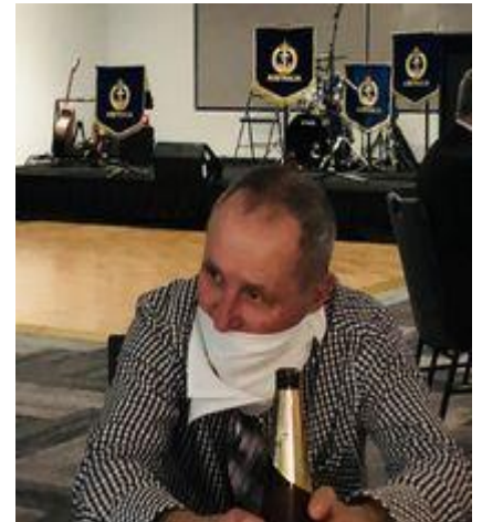
This guy could talk under water