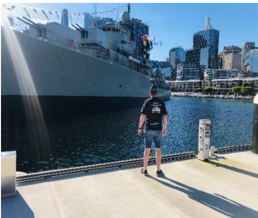
HMAS Vampire (Destroyer) at the Aust Maritime Museum