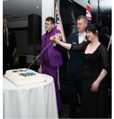
Youngest members cutting the cake