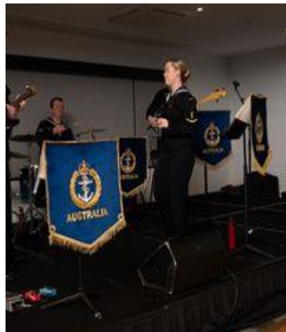
Cerberus Navy Vocalist