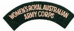
WRAAC School Georges Heights, Sydney 1982

Forward: I am aware that I have covered three men who have served in the Army. I have thought as to who some of the next candidates should be, I had two in mind, so I have picked the one closest to home... actually I have picked someone in my home. This quarter we have the longest serving female from the 30-40 regular members that attend the Lara RSL throughout the year.