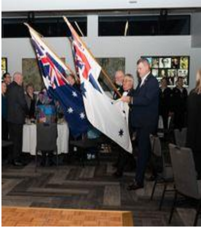
Tri Service Flags enter