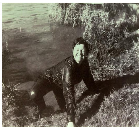
End of the Obstacle Course 1988