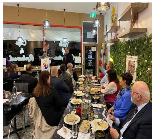
Philippine Restaurant in Bell Post Hill