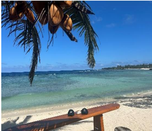
Lara Hats resting just outside the Bar in Vanuatu.