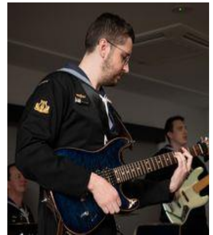
Cerberus Navy Lead Guitarist