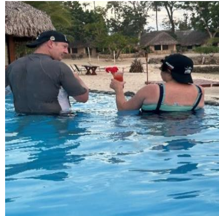
Enduring the harsh pacific conditions in Vanuatu